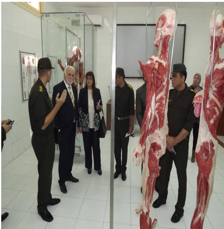
During the tour through the plastinated anatomy lab at AFCM